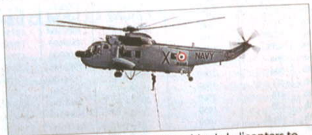
The Indian Navy needs over 100 multi-role helicopters to be positioned on board its most important warships

nt helicopter Indian Navy, o discuss ac- H-124 heli- coming visit nce minister