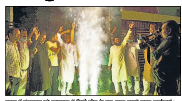
पटना में मंगलवार को उपचुनाव में मिली जीत के बाद जश्न मनाते जदयू कार्यकर्ता।